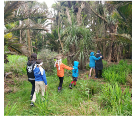
KAS students left to right: Investigating water clarity at the Ōparara River with Tasman Bay Guardians; Learning how to map nature sounds with DOC; Using their senses to ‘meet a tree’ with help from fellow students.