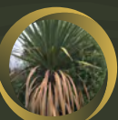
Cabbage tree fronds